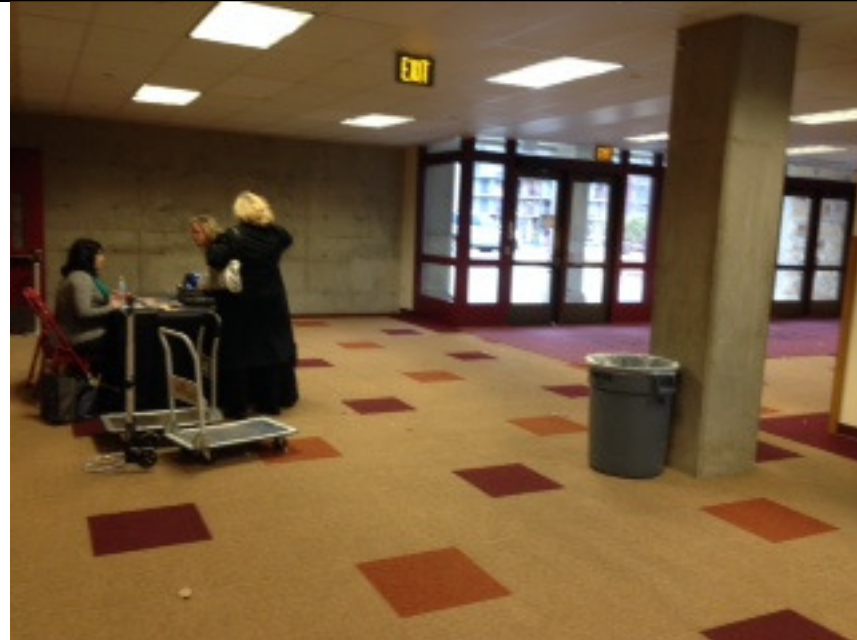
Unit check-in and handicap entrance